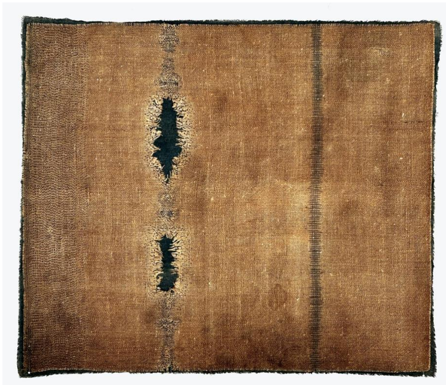
'The Land, The Lochs, The Rivers and the Shore', 85 x 72cm

I gave it a title as I worked; 'The Land, the Lochs, the Rivers and the Shore'. If you've never visited Scotland you may not get the content behind the work but that doesn't matter to me. But maybe, in your mind, you'll be able to imagine it.