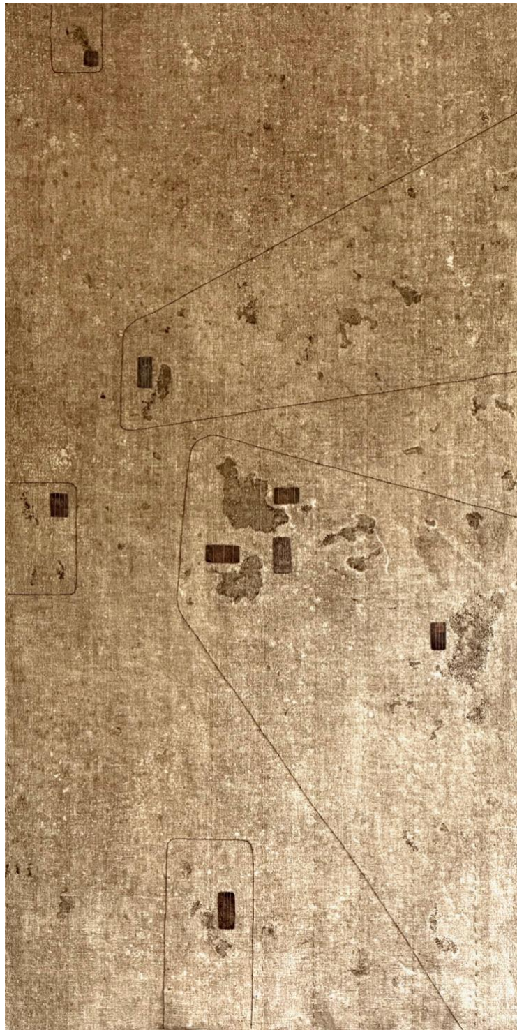
'Ancient Ground', 51cm wide x 101cm tall, 2023

I think it's worth sharing another story about how another piece came into being while we were in Scotland. I'd taken a battered old grain sack with me. It had some faded lines of murky blue warp thread so I prepared a canvas backing cloth using a mix of blue and black pigment. I didn't have an inspiration or thought process until I arrived in Scotland and gazed at the landscape, fished in the streams and lochs and walked the shoreline. A flash of inspiration arrived, a sudden realisation of what I wanted this piece to be about; Scotland – for me a place of sacred ground: