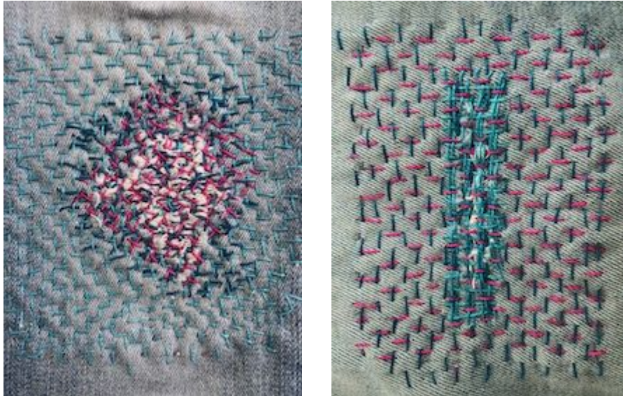
Mixing colours and a 'splat' of weaving.