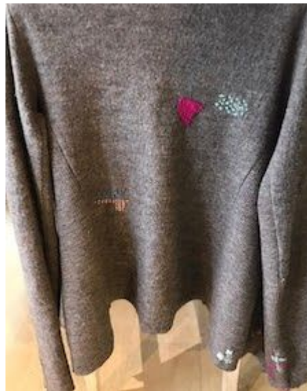
A drift of pink, and I think the cardie is so much more interesting now.