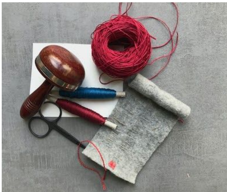
Sewing stuff, with the trusty piece of card.

In the absence of a darning mushroom, use a small water glass or a mug. A piece of a cereal packet is also helpful - cut out a couple of sizes; one measuring about 10cm square, the other maybe 8x16cm as long thin pieces can be good for long, thin tears (stay with me, you'll find out why in a second).