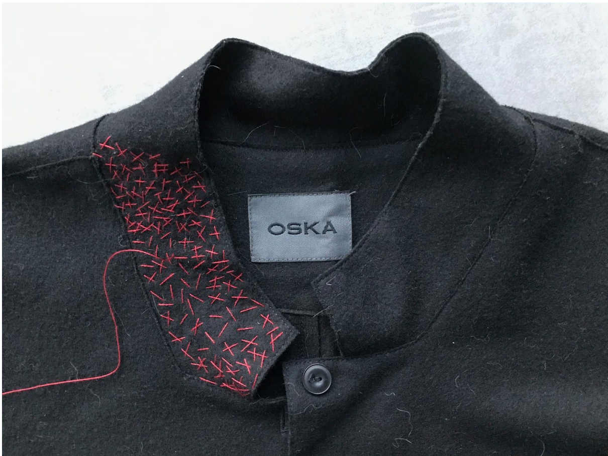
The boring black dress is coming along, complete with cat hairs, an occupational hazard...

Hand stitch, darning and patching all have the benefit of simplicity. No specialist materials are called for, everything you need will probably fit into a small box and you can pick things up, put them down and work at your own pace. Do have a go, you might be surprised at how satisfying it is.