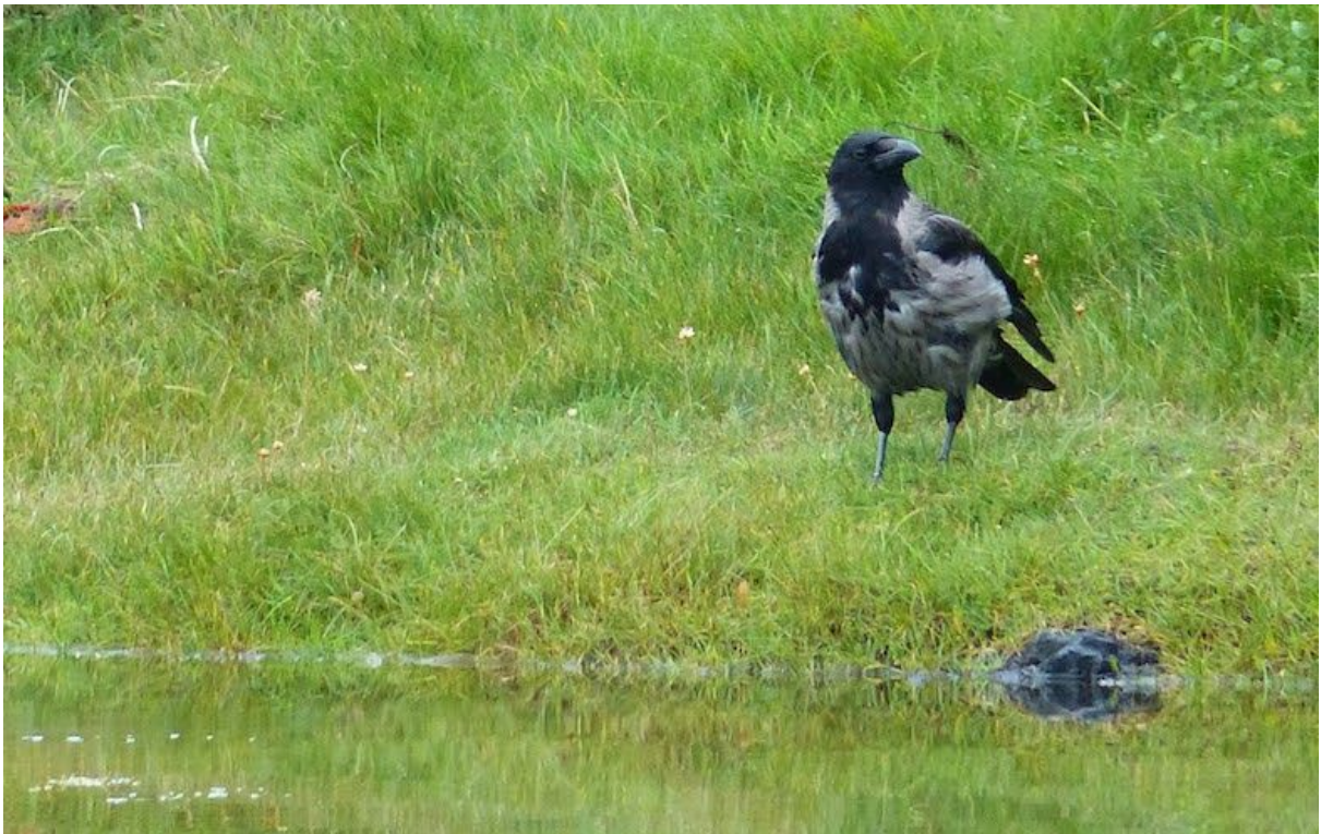
A young raven

Walking, running, cycling are helping us to keep us fit and offer children the chance to release pent-up energy. Observing trees, poking about in hedgerows, noticing plants, discovering insects, birds and animals bring joy and beauty into our lives. We feel the wind on our faces and can breathe deeply.