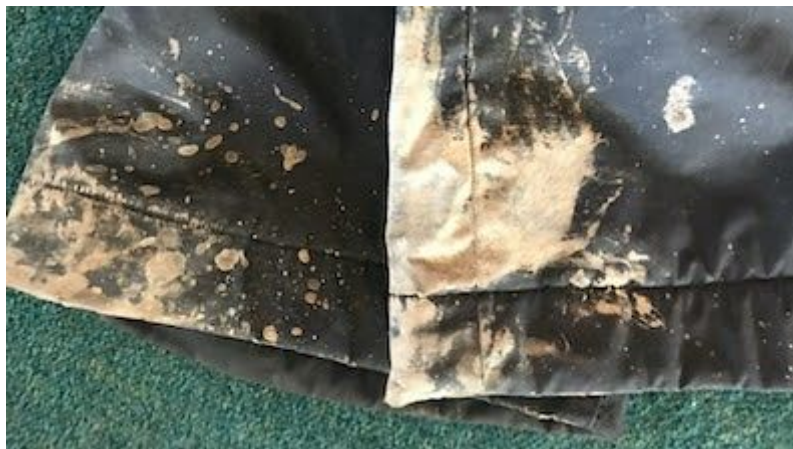
The Grub likes to fold his dirty clothes carefully..., and put them back in a drawer.