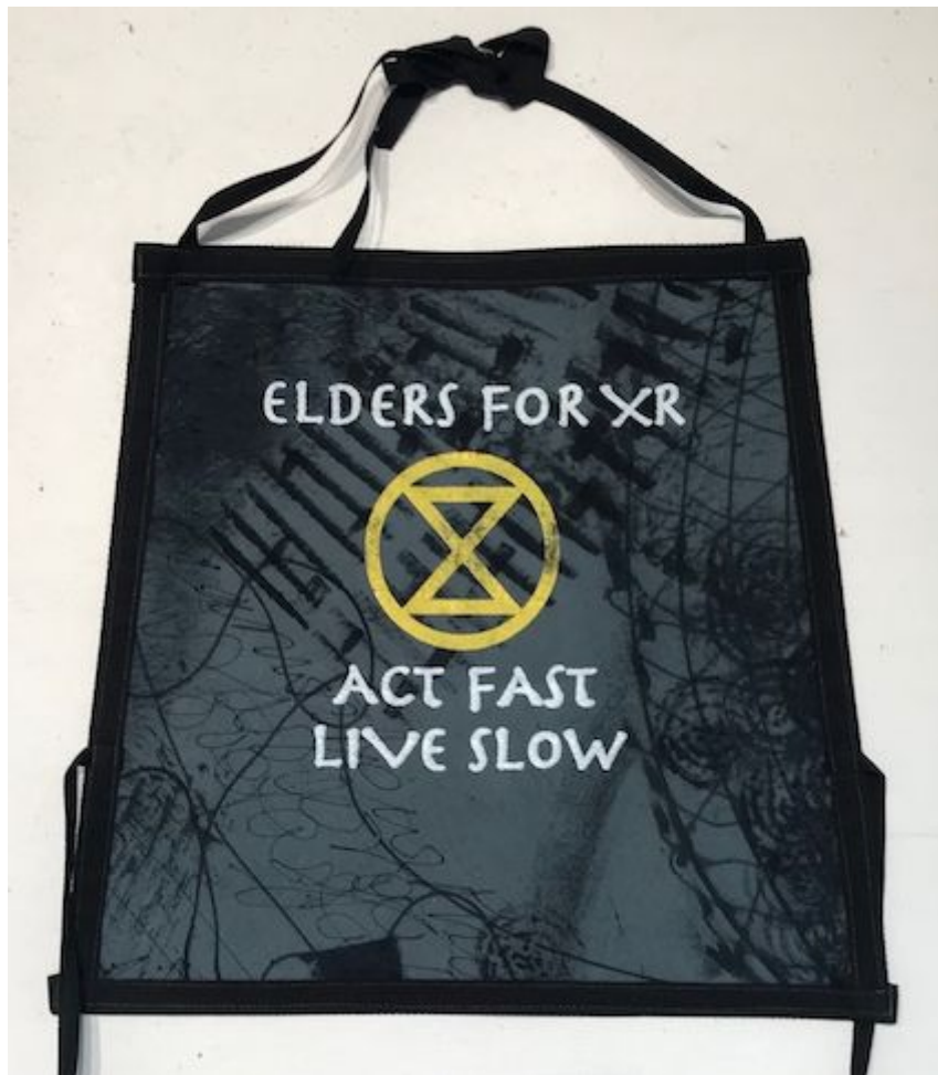
Another 'bib', although we've added 'Change Now' as the bottom line.

If you're interested in joining the rebellion, then simply search 'Extinction Rebellion' and you'll very easily find out how - and it's no longer a U.K. movement, it's a global movement. In November, I may write about our experiences during this period of action, or I may return to art - but perhaps the two are linked as collectively, many of us have come together to make protest banners, placards and sashes. It's been fun, energising and creative and just as importantly, it's about community.