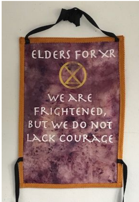
A 'bib' designed to be worn on the chest or on a backpack.